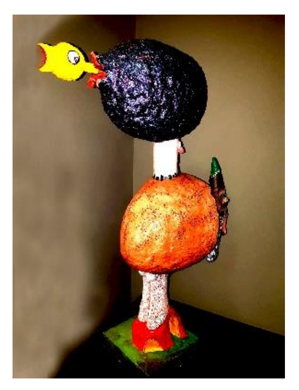
No matter how far it flies, Or how deeply it screamswe will live to tell the tale of our narratives.