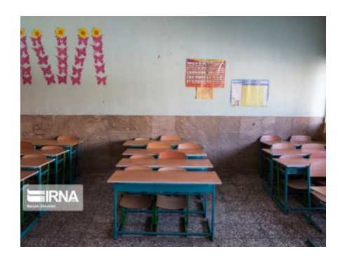
Picture 1: An empty classroom during the COVID-19 pandemic in Tehran, Iran.

the closure of most social, recreational and educational institutions. Educational institutions were forced to lock down or modify their activities to mitigate the risk of spreading the virus. As presented in Picture 1, classrooms have become empty, with children remaining at home under the quarantine and social distancing regulations.