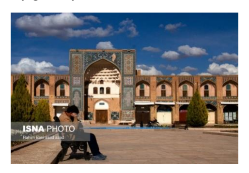
Picture 3: A man grieves in solitude near an empty mosque in Iran.

loved ones. In Iranian culture, gatherings or farewell ceremonies to pay tribute relieves a sense of loss and builds resilience. As picture 3 exhibits, gatherings and close interactions are currently suspended as a preventative measure to mitigate the spread of the virus.